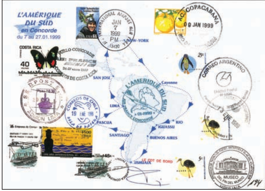
A 1999 Concorde cover records stops made at airports around South America, including Easter Island.

Easter Island (at least as has been established so far) is not known to have had its own stamp issues. However since 1940 Chile has more than made up for that, issuing more than fifty stamps on the island topic. Some of these are a bit obscure, as you have to study the design to catch the connection. Scott 1239, for example, was issued to honor the Capuchin order of monks. In the background are some moai set on a sacred altar. Scott 1254 is supposed to represent the Year of the Ocean; however, the 500-peso value has a moai carving as part of the bottom of the stamp’s design. Other relevant stamps are hidden in sheets of differently designed stamps. For example, Scott 873f is a stamp in the Chilean National Parks set; it shows an Easter Island tern. Scott 674f is the same story; on a sheet of fifteen, one stamp shows a moai.