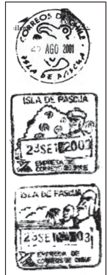
Three examples of pictorial island cancels.

The Chilean Navy did not operate an actual post office on the island. However, postal officials on mainland Chile were becoming more aware of the philatelic potential of their remote possession, and in 1938 a six-stamp set was proposed to honor the fiftieth anniversary of the island's annexation. This set was never actually issued, but a set of artist's drawings is known. In