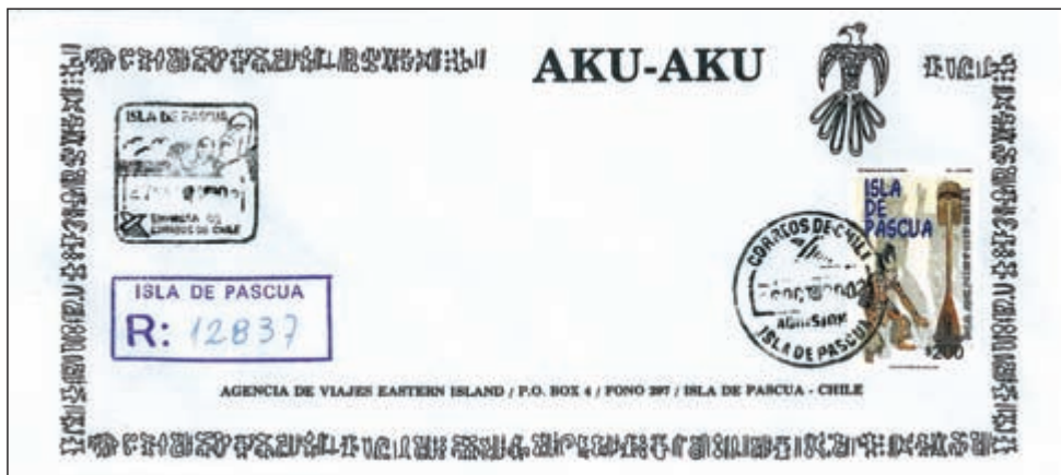
Intra-island registered cover to a local travel agency.

A few other nations have released stamps with island motifs as well. The most notable is an issue in the 2003 250th Anniversary of the British Museum set (Scott 2164, SG 2409). This shows one of the prized possessions of the