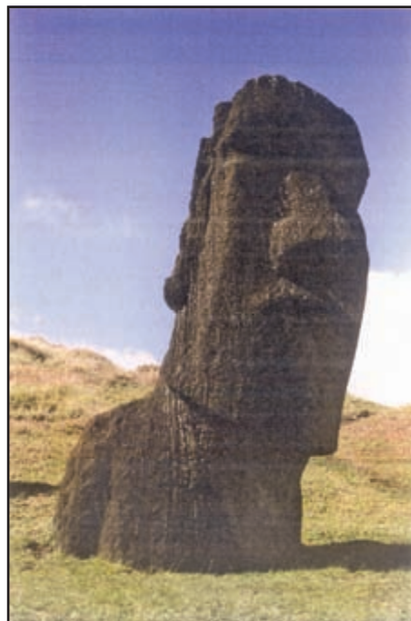
Typical statue, on slopes near the stone quarry where they were made.

Sometime during that period, at least one Chilean stamp is known to have been overprinted with the words "Rapa Nui." However, this is believed by most experts to have been a bogus issue. A 1910 cover has survived that bears an "Isla de Pascua" marking in pen over a Chilean stamp. This cover was carried by the yawl Pandora from Easter Island and was finally mailed at New Island, in the Falklands. That cover, at least, survived. In 1916 the yacht Carnegie , under command of