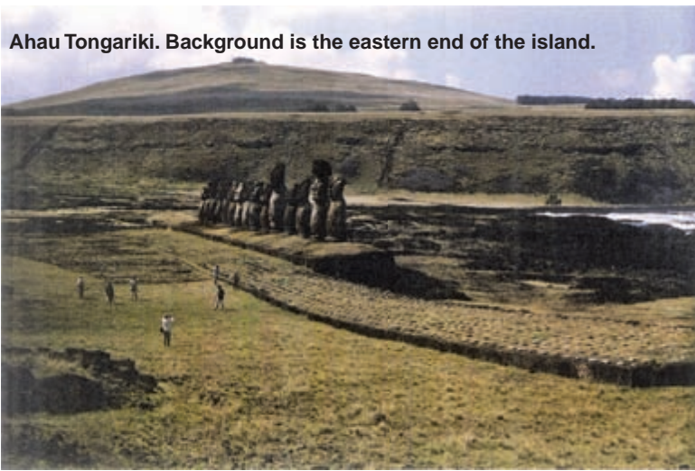
Ahau Tongariki. Background is the eastern end of the island.

cancels, some quite picturesque, have been adopted. At least a dozen types have been recorded. The first one was a simple “Isla de Pascua Chile” circular device. Several cancels in the 1970s through the 1990s were rectangular and involved at least one, and in several cases, two moai. One design also included an example of the rongorongo board hieroglyphics. There’s even a cancel showing the famous “birdman” symbol.