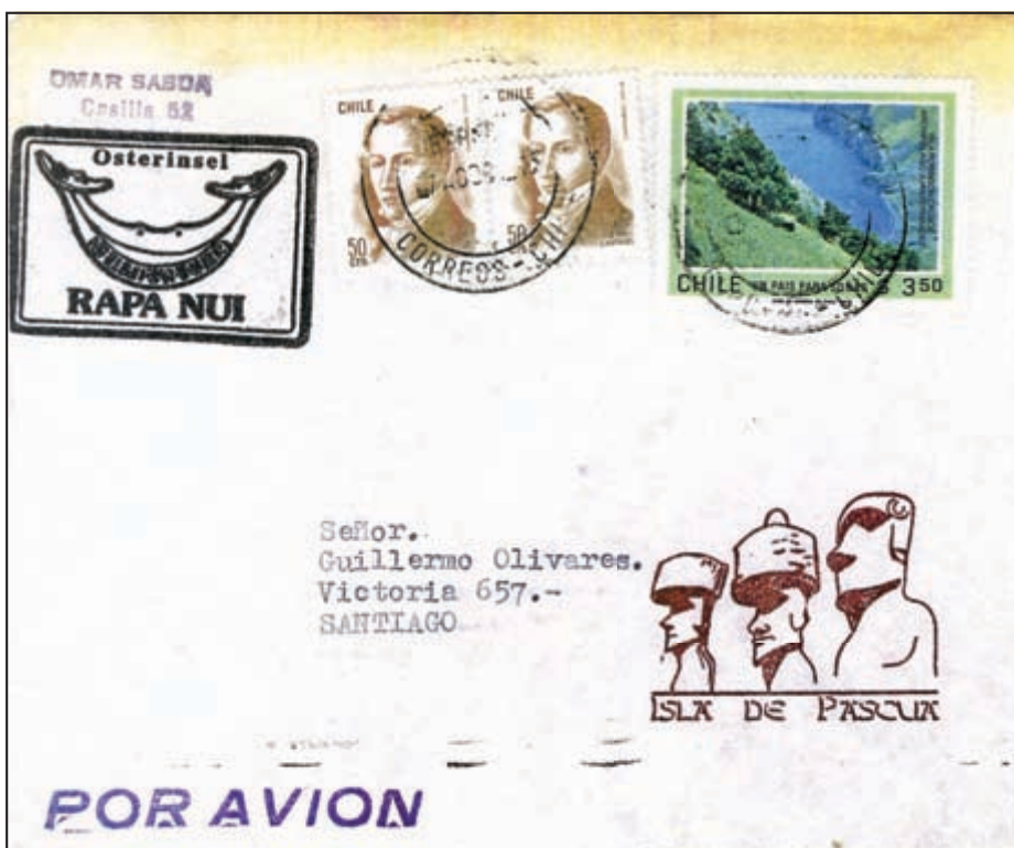
Commercial cover to Chile, with various island cachets.