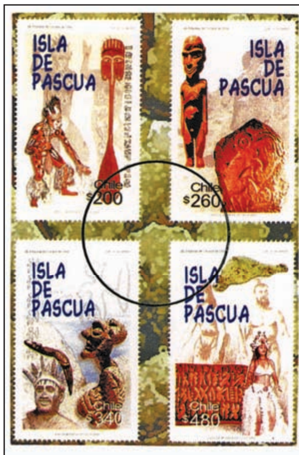
Four stamps (Scott 1321–1324) show artifacts and dancers.

On November 17, 1953, the island officially opened its first civilian post office. It is in a modest building on a tree-shaded avenue in Hanga Roa.