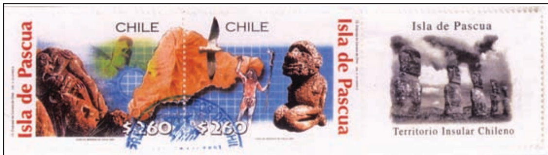
Two Chilean stamps (Scott 1361) show island tourism. Vignette shows moai of Ahau Akivi.