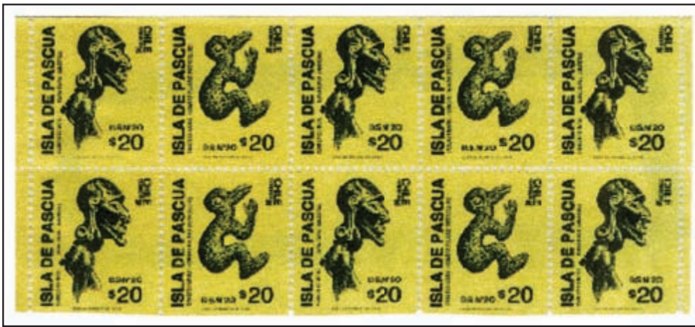
Booklet pane shows island carvings. Also found in other colors and denominations.