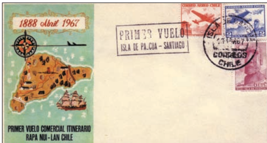
First commercial flight via LAN-Chile from the island to Santiago in 1967.