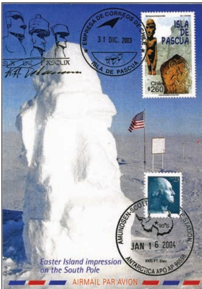
The boys at the South Pole were having a bit of fun, making this ice moai. How it got from Easter Island to the Pole in sixteen days, I don't know.

with major catalogue status, with numbers between Scott 780 and Scott 956. These consist of two different designs, a carved wooden head and a stone depiction of a birdman. These stamps come in different colors, denominations, and overprint types.