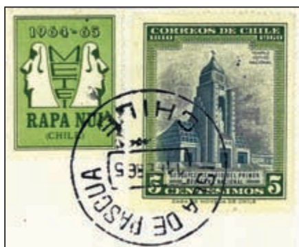
"Cinderella" label used on island by METEI expedition in 1965.

The most complicated Easter Island stamp issue is the group of booklet stamps released in 1988, 1989, and 1991. There are ten different varieties