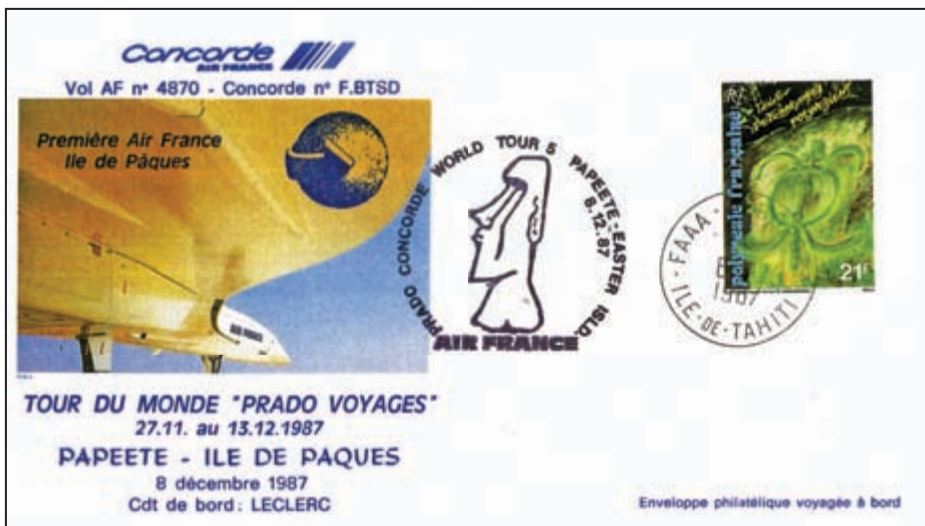
A 1987 commemorative cover for a flight of the Concorde from Tahiti to Easter Island.