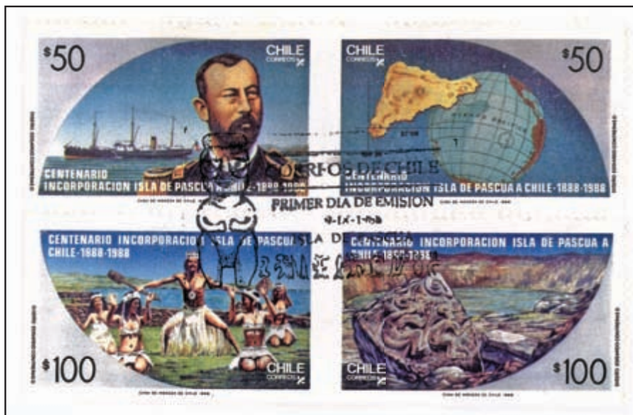
Four stamps and a souvenir sheet note the centenary of the annexation of Easter Island by Chile (Scott 791–794).

Since the post office has been open, a large number of cancels, some quite picturesque, have been adopted. At least