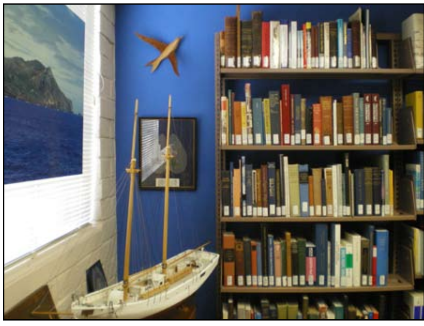
A model of the 19th Century-built mission ship, Pitcairn, rests between the bookshelves at the Pitcairn Islands Study Center.

Small group tours of the Pitcairn Islands Study Center's 1,500-book library will be conducted. The Center's library constitutes one of the world's largest collections relating to the Mutiny on the Bounty, Captain William Bligh, HMAV Bounty , and both Pitcairn and Norfolk Islands.