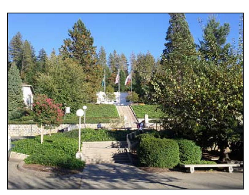
The Pacific Union College campus mall, surrounded by foliage aplenty, is an impressive site.

be conducted via the Internet. Rare, decorated tapa cloth produced on Pitcairn by islander Meralda Warren and Pitcairn children will be displayed and offered for sale. A market for Pitcairn handicrafts and curios will be open at scheduled times. The Pitcairn Islands Philatelic Bureau and others will offer a selection of stamps and covers, and a USPS postal station will operate, using a postmark specially designed for the conference.