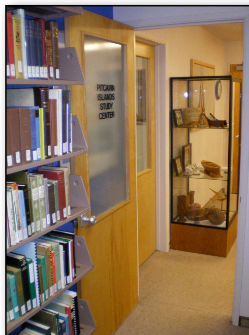
Figure 2 - This partial interior view of the library shows some of the Pitcairn artifacts which are on display.