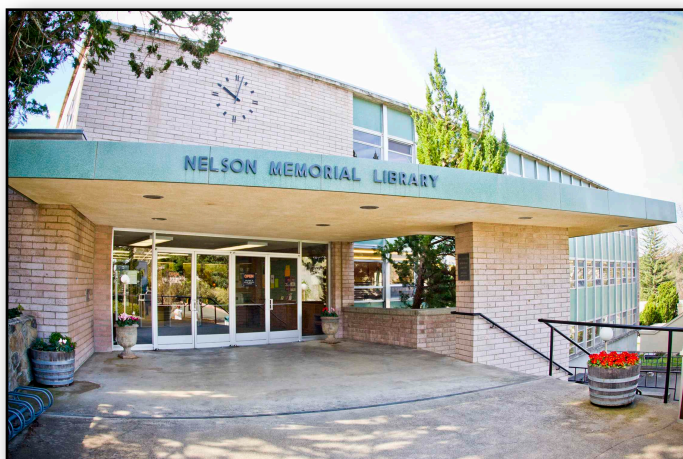
Figure 1 - The Pitcairn Islands Study Center is located in Nelson Memorial Library on the campus of Pacific Union College.

The Bounty -Pitcairn Conference 2012, co-sponsored by the Pitcairn Islands Study Group and the FRIENDS of PITCAIRN Yahoo! group, will be held from Sunday, August 19 through Tuesday, August 21, 2012 at the Pitcairn Islands Study Center at Pacific Union College in Angwin, California. Angwin is situated near San Francisco among Napa Valley's famed vineyards. The 2012 program will follow the same basic format as the successful Bounty -Pitcairn Conference held in St. Petersburg, Florida in 2005. It is anticipated that about 100 people will attend.