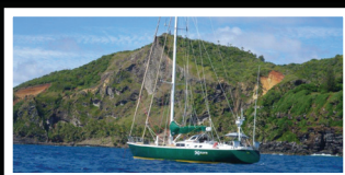
Pitcairn Travel & Xplore Expeditions