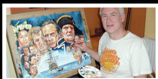
Celebrating Mutiny on the Bounty