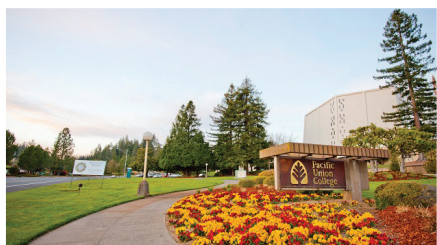
The Pacific Union College campus is set in a manicured garden along the main street of Angwin in California's beautiful Napa Valley.

Final preparations are underway for Bounty-Pitcairn Conference 2012 being staged Sunday, August 19 - Tuesday, August 21, 2012 at the Pitcairn Islands Study Center on the Pacific Union College campus in California's wine-rich Napa Valley. As of early May, scores of people had committed to attend, and it is expected that many more will register by mid-August.