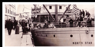
Admiral Byrd at Pitcairn, 1939